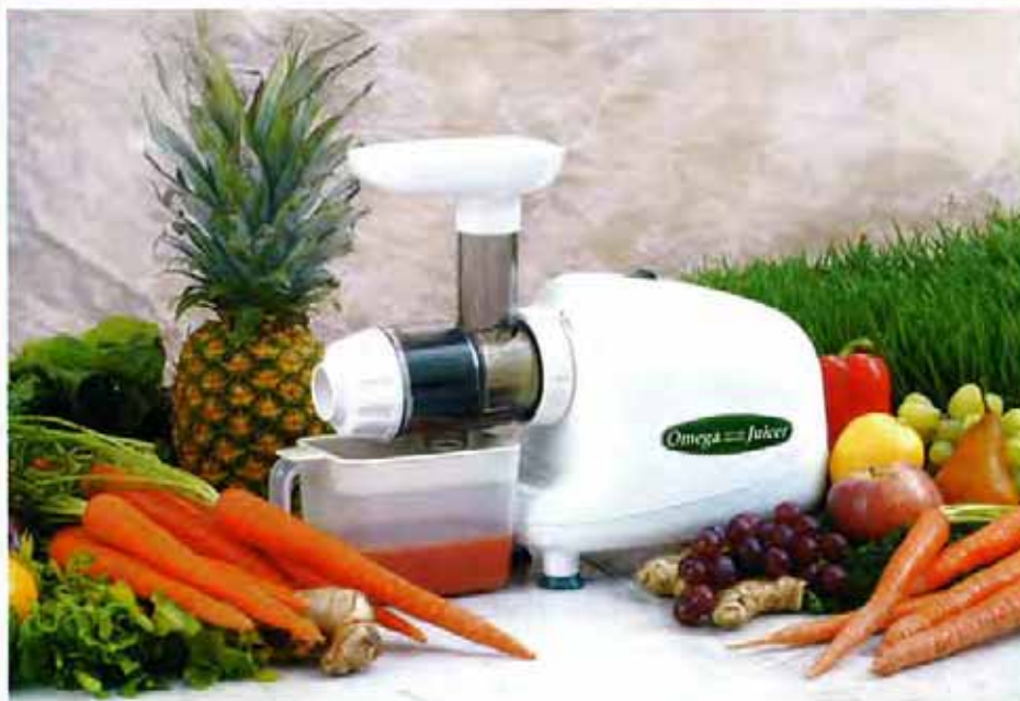
Fruit and Vegetable Juicer

NEW PATENTED TWO-STAGE SYSTEM PROVIDES THE MAXIMUM EFFICIENCY AND VERSATILITY