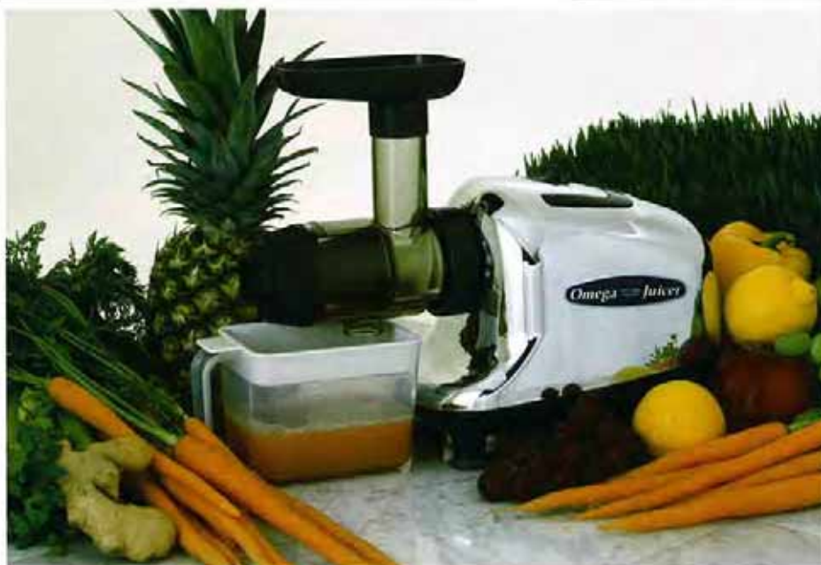
Fruit and Vegetable Juicer

NEW PATENTED TWO-STAGE SYSTEM PROVIDES THE MAXIMUM EFFICIENCY AND VERSATILITY