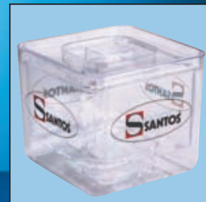
N° 53 Gris