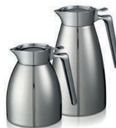
Qline stainless steel decanters

Bravilor Bonamat supplies various vacuum flasks that keep the temperature at its peak for a long time.