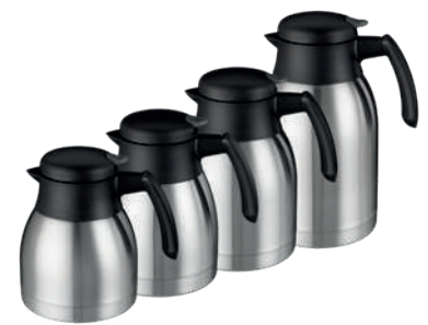
Double-walled vacuum flasks